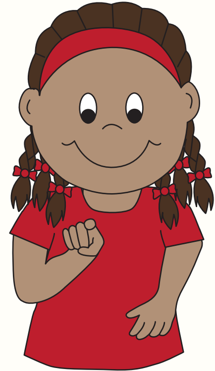
Point to other person.