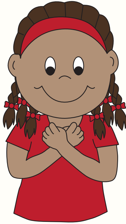
Cross arms on chest.