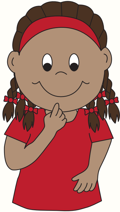
Point to self.